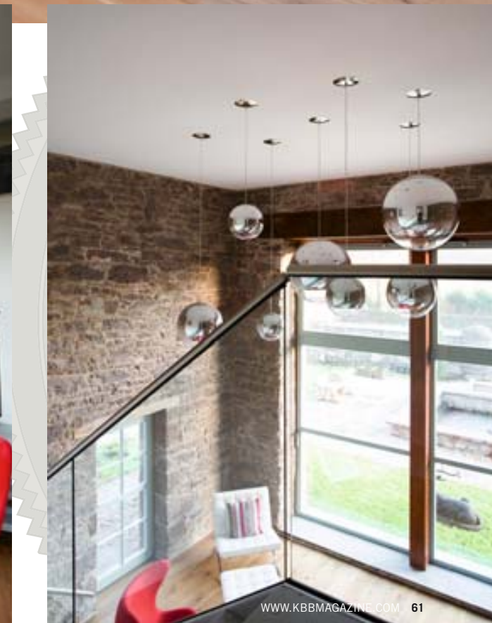
Top: The kitchen blends clean lines with warm, organic textures seen in the walnut worktops and stone flagstones, while the mirror copper pendants by Tom Dixon cast a warm glow that complements the timber. Above: The island functions as a prepping zone and doubles as an informal spot to grab a bite or have a drink, while the elongated dining table easily sits 16 – creating a great party space in this vast room. Opposite page, top: John highlighted the function of the upstairs library with this quirky Genuine Fake Bookshelf wallpaper by Deborah Bowness. This feature wall is used to disguise a doorway into a guest wing. The chair and sofa were auction finds that John had reupholstered. Bottom left: Conceived as a space to simply hang out, the orangery features Tom Dixon’s Mirror Ball pendants alongside an eclectic mix of furniture, including Arne Jacobsen’s classic Egg chair. Bottom right: The orangery as seen from the first floor where the space is given character by its exposed stone walls.